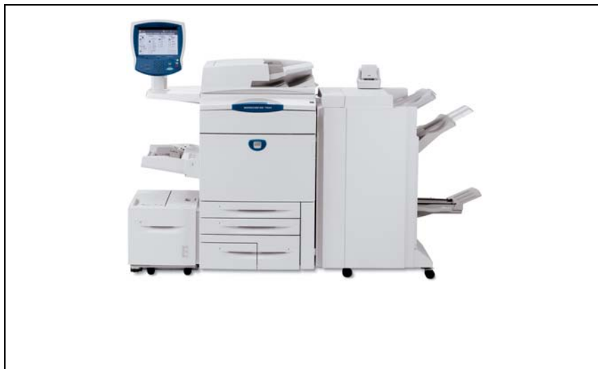
Figure 2: Physical Boundary

The physical scope and boundary of the TOE consists of the Xerox WorkCentre devices and include installed Xerox accessories. For this evaluation, all models of the TOE include the Image Overwrite Security accessory and the embedded FAX accessory. In the MFD models the network controller and its associated software is included in the configuration.